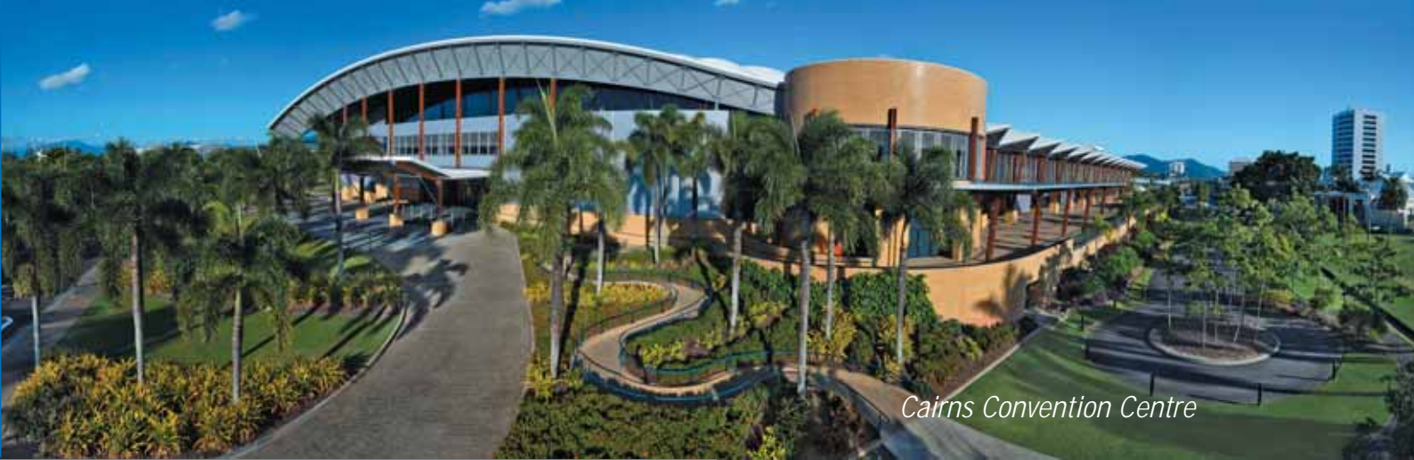
Cairns Convention Centre